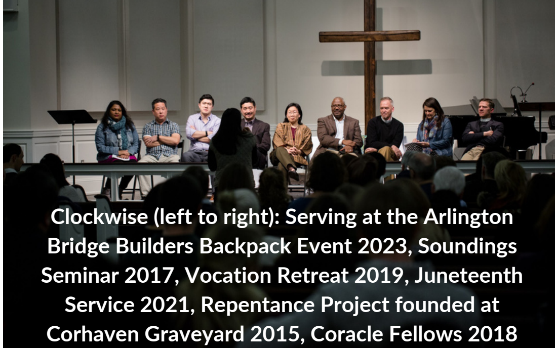
Clockwise (left to right): Serving at the Arlington Bridge Builders Backpack Event 2023, Soundings Seminar 2017, Vocation Retreat 2019, Juneteenth Service 2021, Repentance Project founded at Corhaven Graveyard 2015, Coracle Fellows 2018