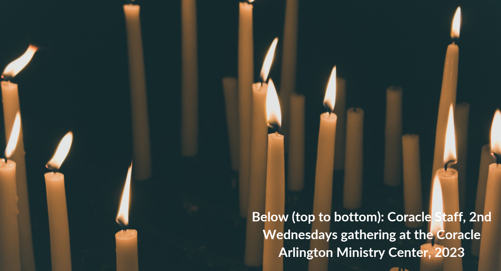
Below (top to bottom): Coracle Staff, 2nd Wednesdays gathering at the Coracle Arlington Ministry Center, 2023