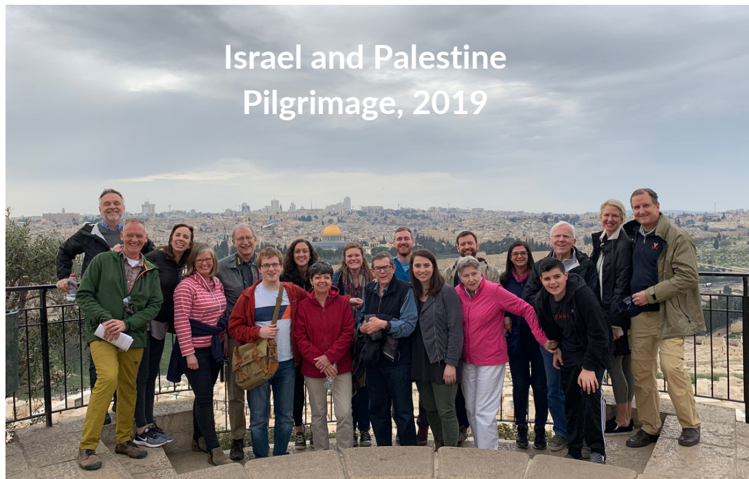
Israel and Palestine Pilgrimage, 2019