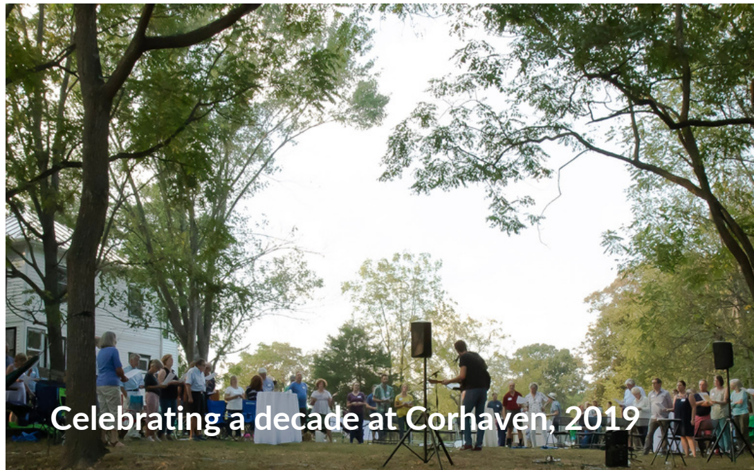
Celebrating a decade at Corhaven, 2019

~Spiritual Formation Fellowship Program Participant