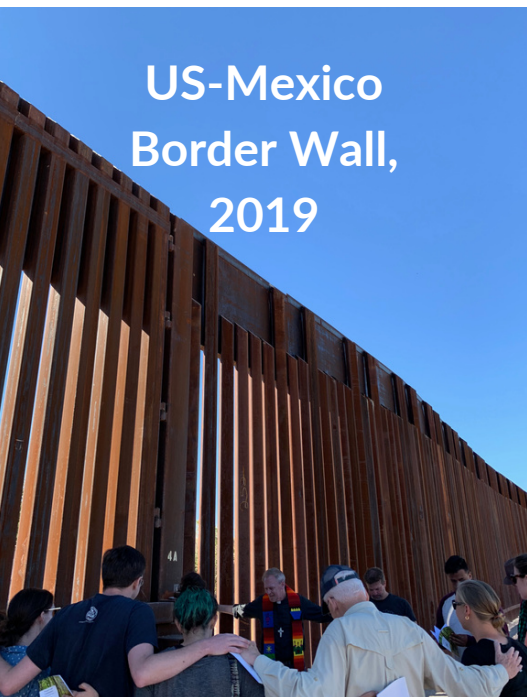
US-Mexico Border Wall, 2019