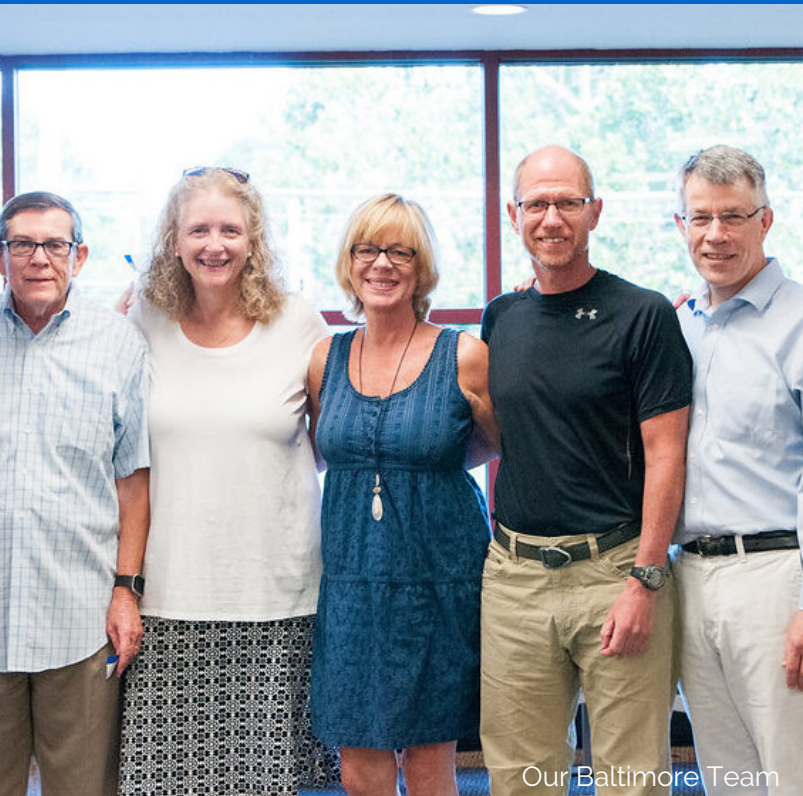
Our Baltimore Team

Through small groups, group retreats, spiritual direction, seminars and other events in Baltimore and Northern Virginia, Coracle continues to be a lot more than Corhaven.