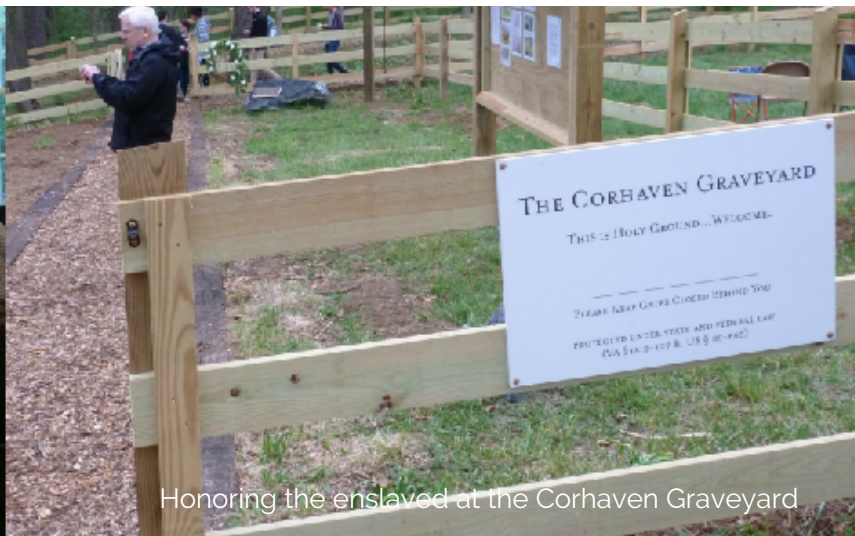
Honoring the enslaved at the Corhaven Graveyard