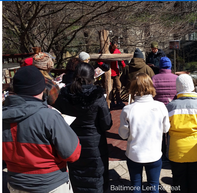
Baltimore Lent Retreat