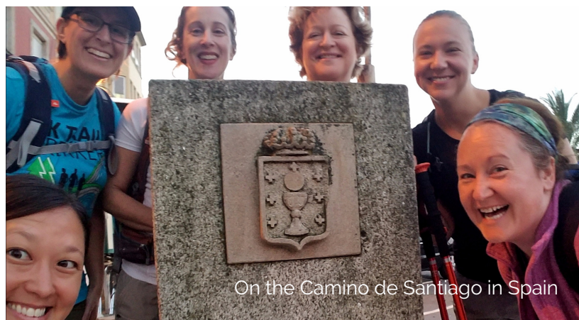
On the Camino de Santiago in Spain