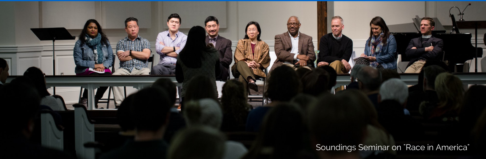
Soundings Seminar on "Race in America"

Racial divisions and the lack of peace continue to shake our country and our world. Part of our efforts at Kingdom Action is to help others be reconcilers and peacemakers.