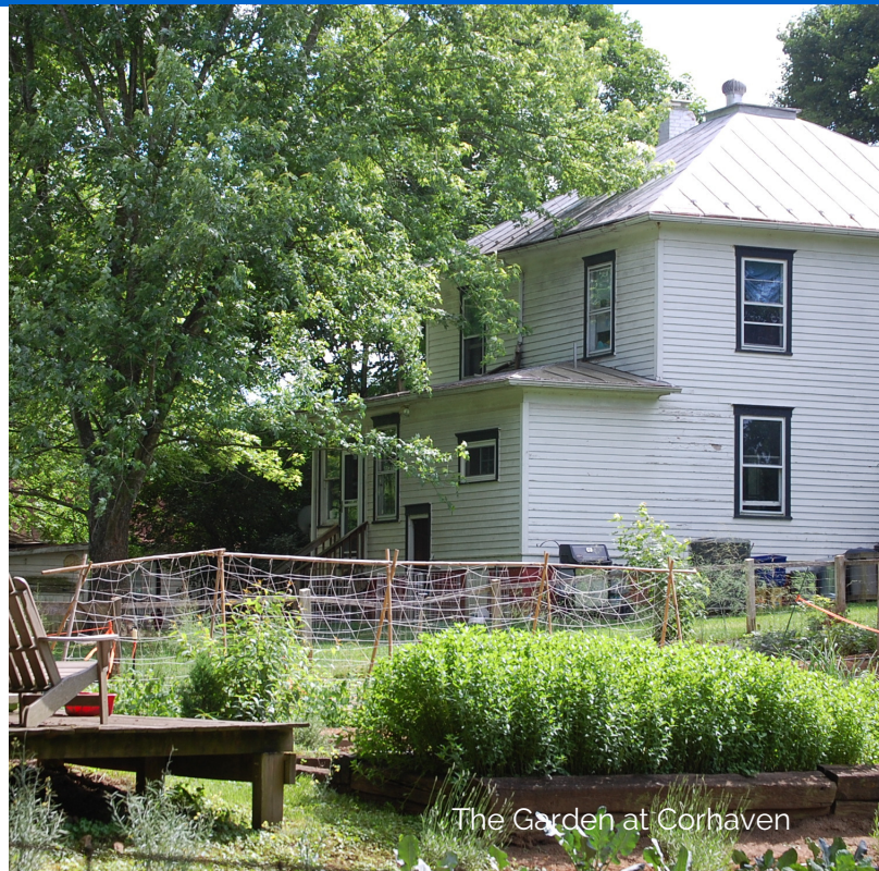
The Garden at Corhaven