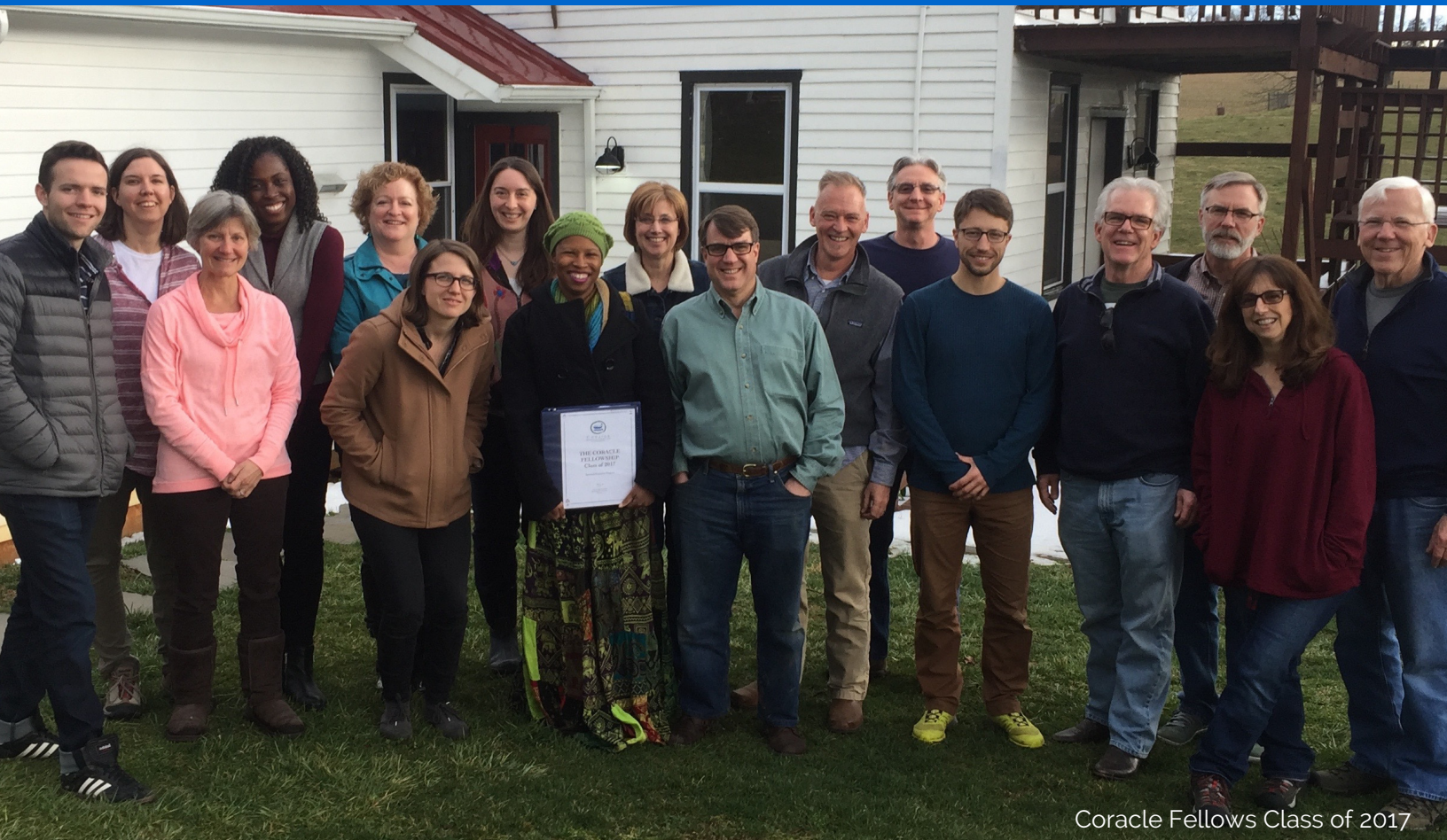
Coracle Fellows Class of 2017

The Coracle Fellowship is a yearlong process of spiritual formation, learning, experience, and deepening in community, for Kingdom Action and the sake of the world.