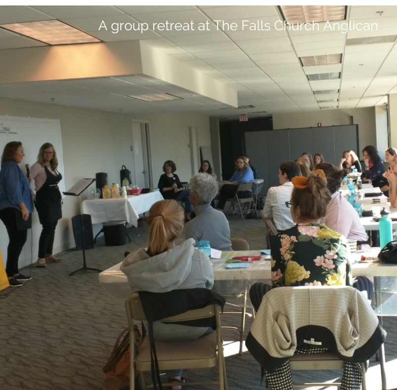
A group retreat at The Falls Church Anglican