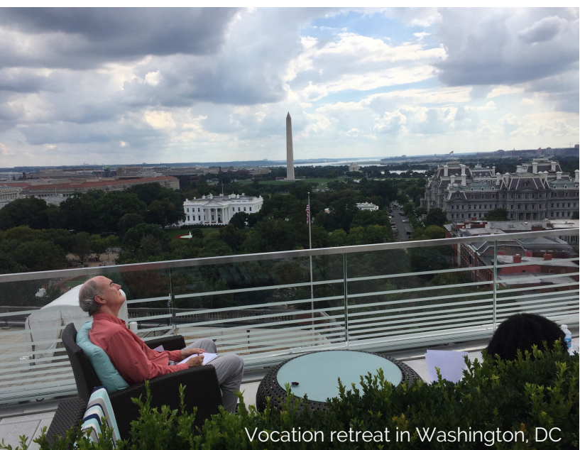
Vocation retreat in Washington, DC