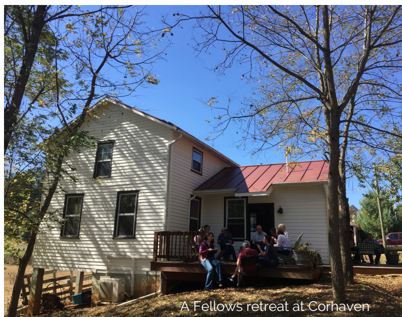
A Fellows retreat at Corhaven