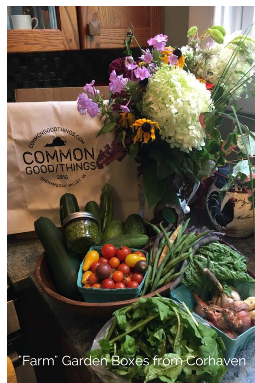
"Farm" Garden Boxes from Corhaven