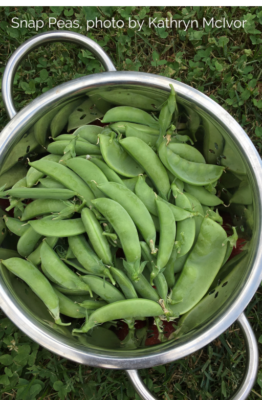
Snap Peas