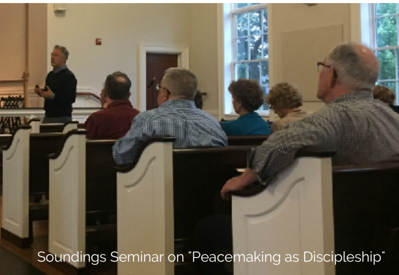
Soundings Seminar on "Peacemaking as Discipleship"