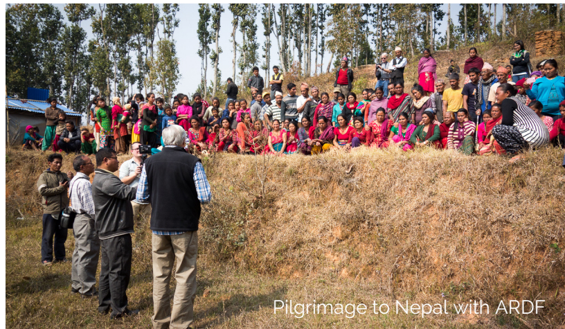
Pilgrimage to Nepal with ARDF