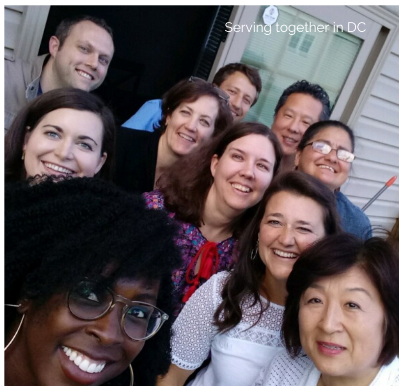
Serving together in DC