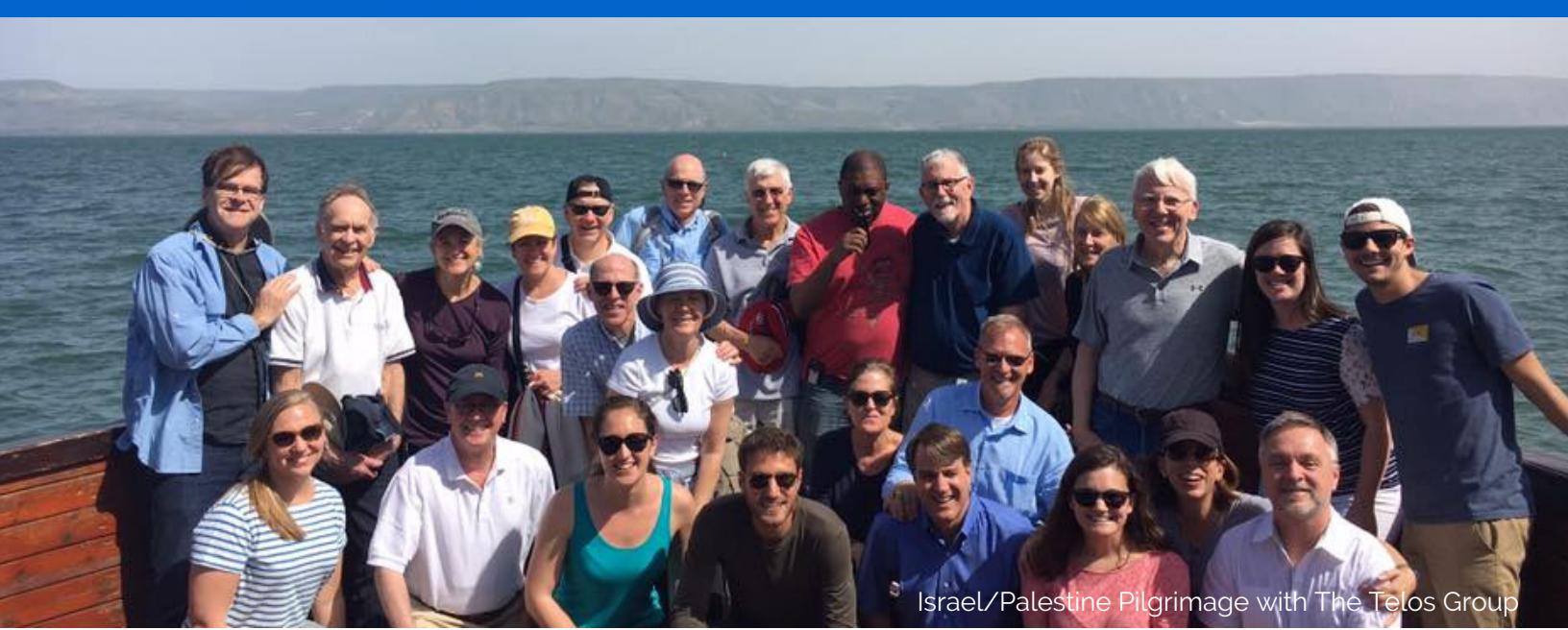
Israel/Palestine Pilgrimage with The Telos Group

We introduced this line of ministry this year.