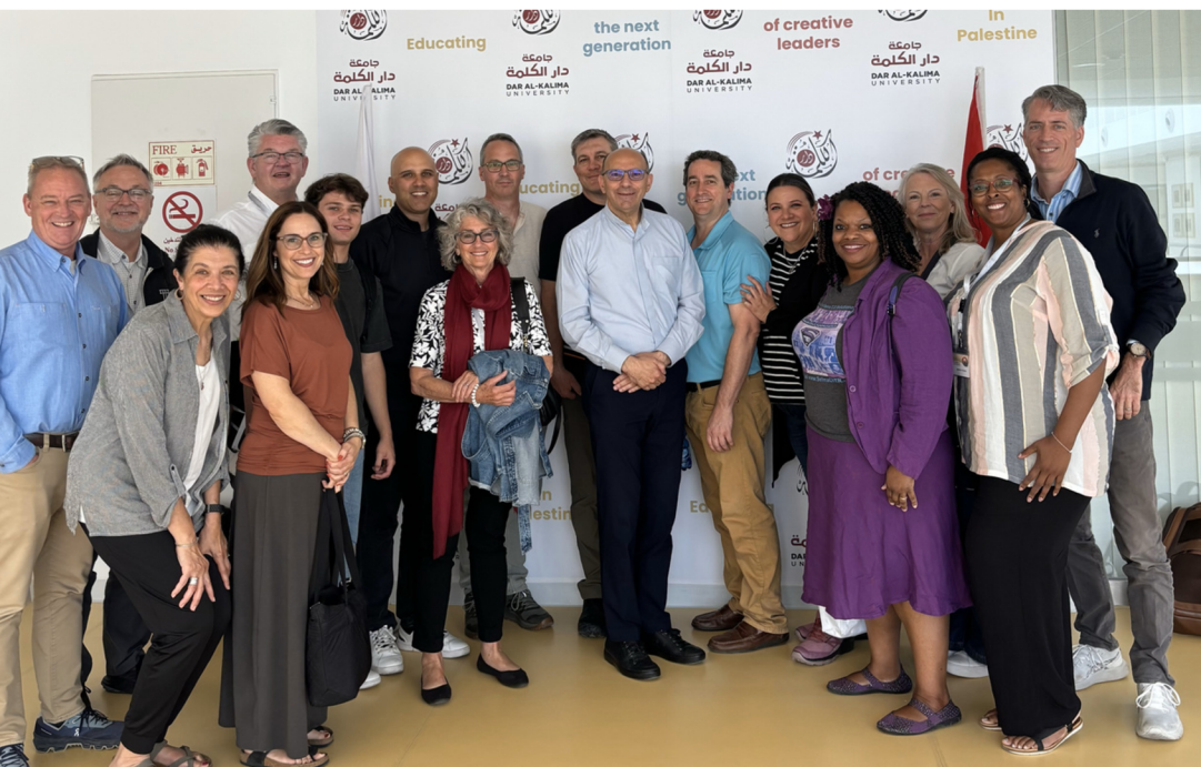
Opposite page (clockwise from top left): Racial History + Activism tour in Arlington; Corhaven work day; Baltimore community gathering; Corhaven garden; volunteer gathering at the Ministry Center; grief retreat at Claggett Center. This page (clockwise from top left): Mount of Olives; SLAQ youth at Corhaven Graveyard; Eagle Scouts volunteer at Corhaven graveyard; with the Telos Group at Dar Al-Kalima in Bethlehem in May; grief retreat.