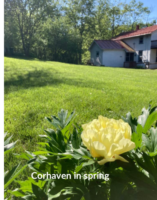
Corhaven in spring

"I felt more alive on the Faith Adventure than I have ever been in my life."